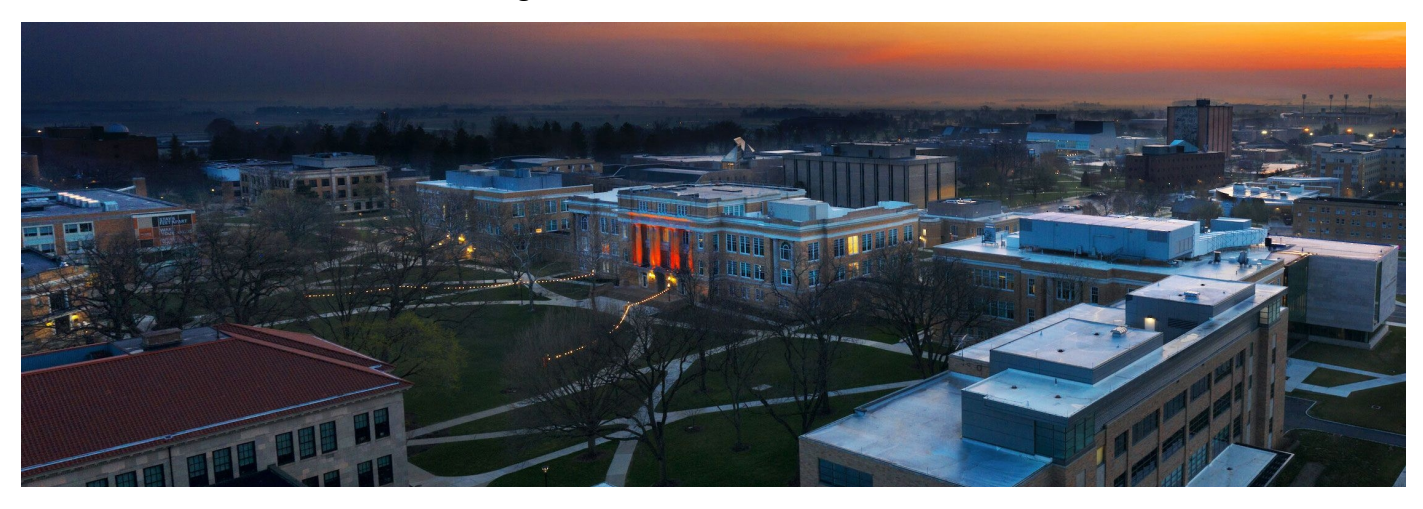
Location: Bowling Green State University 1535 E Wooster, Bowling Green, Ohio 43403