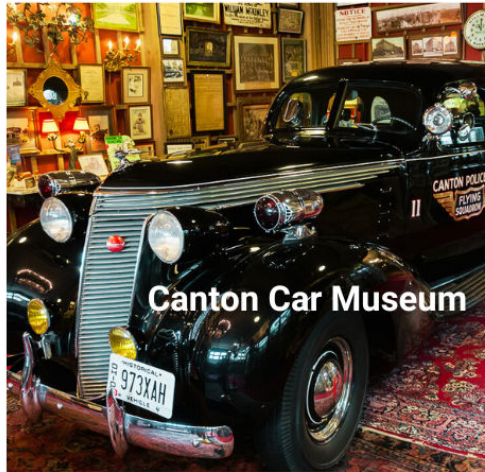
Canton Car Museum