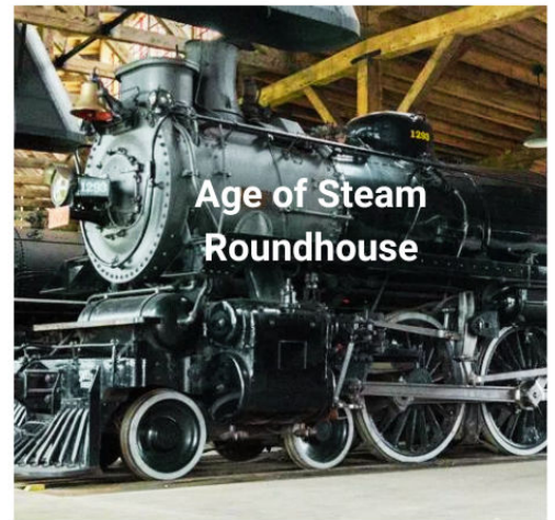
Age of Steam Roundhouse