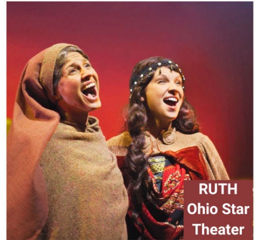
RUTH Ohio Star Theater