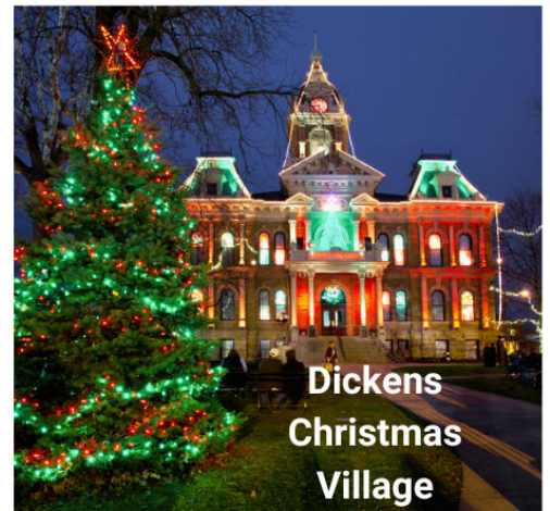
Dickens Christmas Village