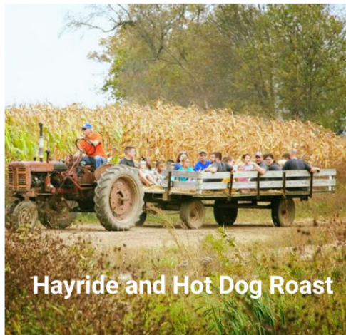
Hayride and Hot Dog Roast